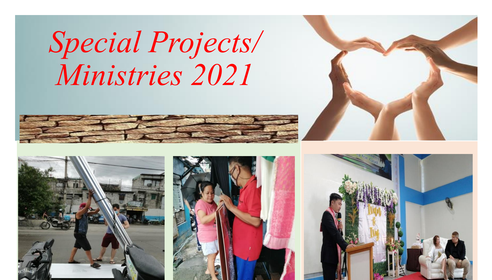
House Repair Project Distributed materials and covered the cost of labor for repair.