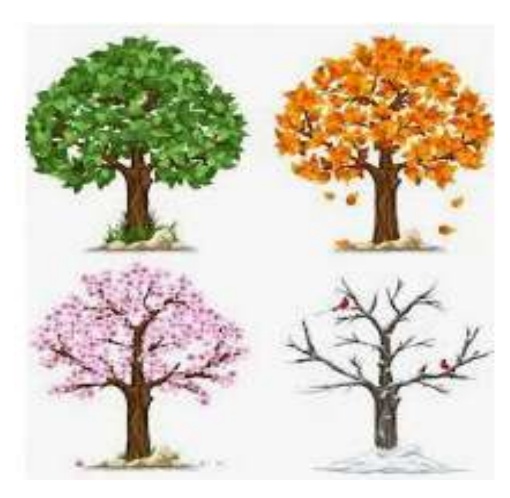
THERE IS A TIME FOR EVERYTHING, AND A SEASON FOR EVERY ACTIVITY UNDER THE HEAVENS. ECCLESIASTES 3: I

uneconomical to repair; a kindergarten to be set up for the Gypsy children; their crops and farm animals to be a productive source of food for them and the poor; for the team to be greatly encouraged as they serve the Lord. ROMANIA