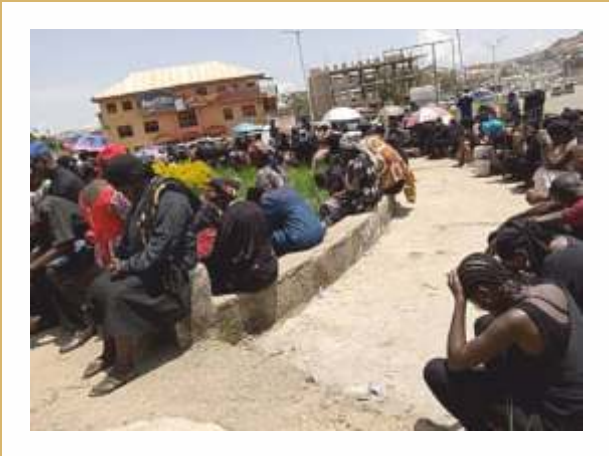
5000 people at 16 roundabouts across the city sat in the dirt, in the hot sun, dressed in black, with their heads bowed and cried out to God for Nigeria.

“We sat and cried out to God for mercy from eight in the morning until four in the afternoon on the 10th of June. In Nigeria we have a God-sized problem that needs a God-sized answer!” Tassie. (Earlier this year, Tassie felt burdened by God to call people to pray because throughout Nigeria, the nation is experiencing insurgencies, banditry, kidnapping, attacks on villages and the killing of Christians)