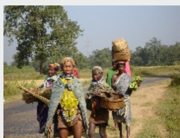
Good News for the least reached in India