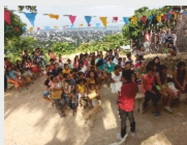
Church planting in the Philippines