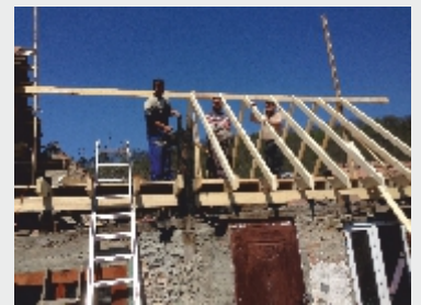
Building projects in Romania