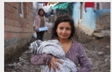
Pro-life, a house of hope in Romania