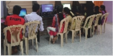
Computer training in India