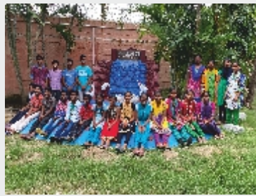
A home for children in need in India