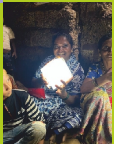
Solar lights are received with thanks and excitement. India