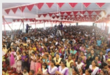
Youth evangelistic camp in India