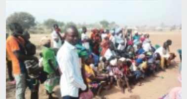
Work among persecuted & displaced, Nigeria