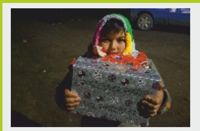
Family Christmas shoeboxes in Romania

ALL THINGS COME FROM YOU O LORD AND OF YOUR OWN DO WE GIVE YOU..