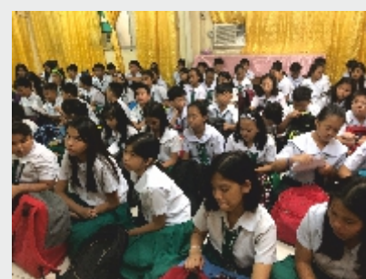
Campus evangelism in Philippines