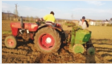
Livelihood programme in Romania