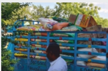
Covid relief and help for the hungry in India