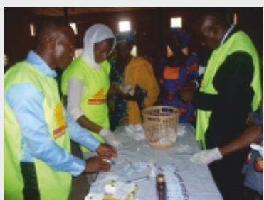
Testing for HIV/AIDS in churches in Nigeria

CHILDREN'S WORK CHRISTMAS SHOEBOXES CHURCH PLANTING DISCIPLESHIP EDUCATION EMPLOYMENT TRAINING EVANGELISM LIVELIHOOD PROJECTS MEDIA MINISTRY MEDICAL MINISTRY PRO-LIFE RELIEF PROJECTS