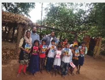
Sunday school in north India