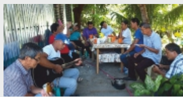
Pastors and leaders fellowship in Philippines