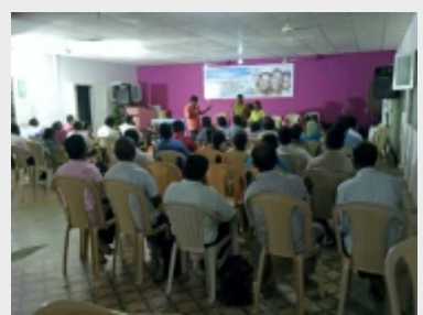
Bible School training in India