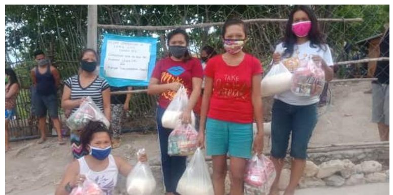
Thank you to all those you have donated to help feed these hungry families. The local government officials are very happy with what CWTP are doing.