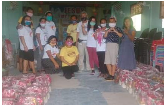
On Tuesday 28 th May, the team distributed these food packages.