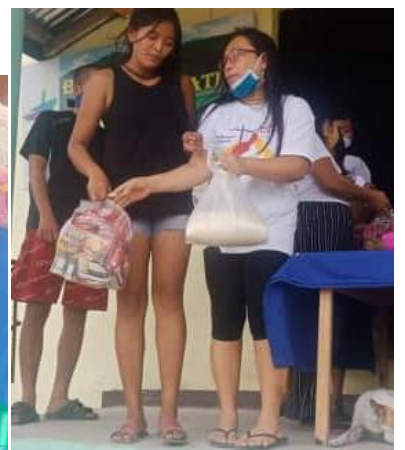
One member of each of these poor families came to the food distribution centre to hand in their voucher and collect their food package for their family