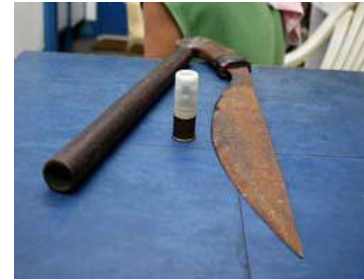
Sumpak - home made gun

My relatives paid my bail, but even though I had experienced being in jail, I still continue my bad lifestyle. At the age of 19, I was promoted to be a gang leader. I continued to be an alcoholic, gambler, and even taste some drugs because of my stubbornness; I was brought in the hospital and almost lost my life in one of the gang wars.