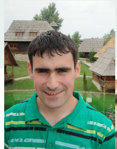
Seminar on preaching

"I learned what preaching is all about and how to prepare a sermon. Every text in the Scriptures contains an important truth and cannot be interpreted which ever way people like it. I saw humility in our teachers, willingness to answer every single question and I saw that they live a life according to God's word."