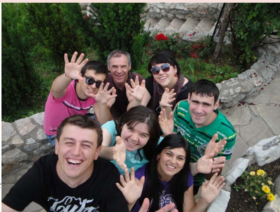
12 th of June 2011, Bijeljina, Bosnia & Herzegovina; visits to churches

With the staff team and the students of HUB