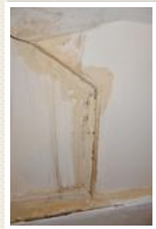
RAIN POURING IN