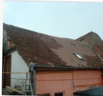
NEW ROOF APPEAL