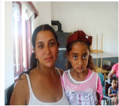
LADIES GROUP RESTARTS